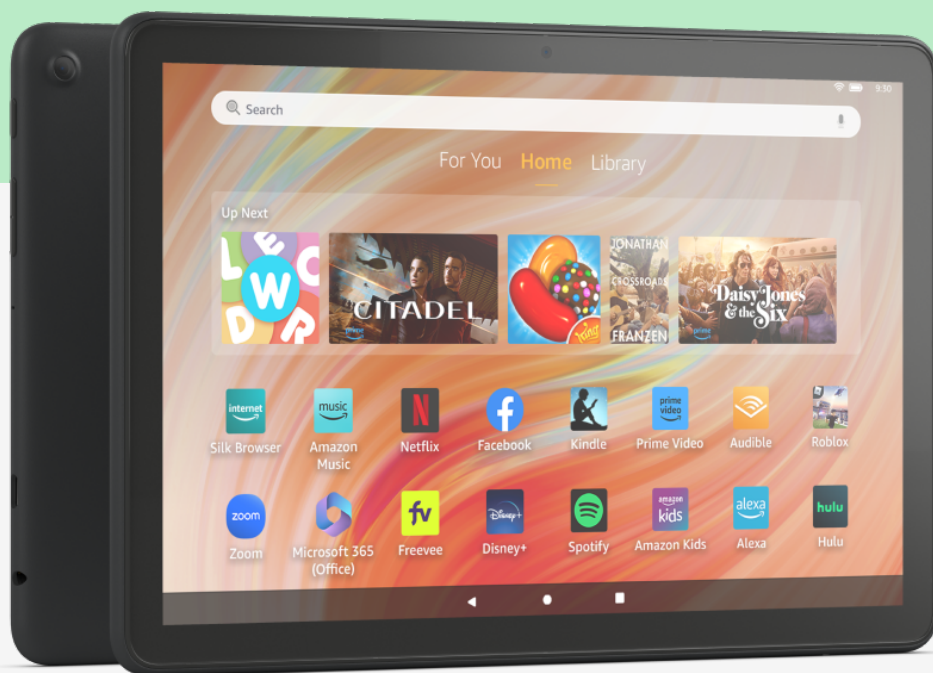
Figures apply to only Fire HD 10 Tablet 32GB 13th Gen, not including bundle accessories

Built to last. But when you're ready, you can trade-in or recycle your devices. Explore Amazon Second Chance .